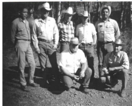
Range camp counselors 1968