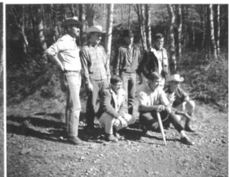
Range camp campers 1968